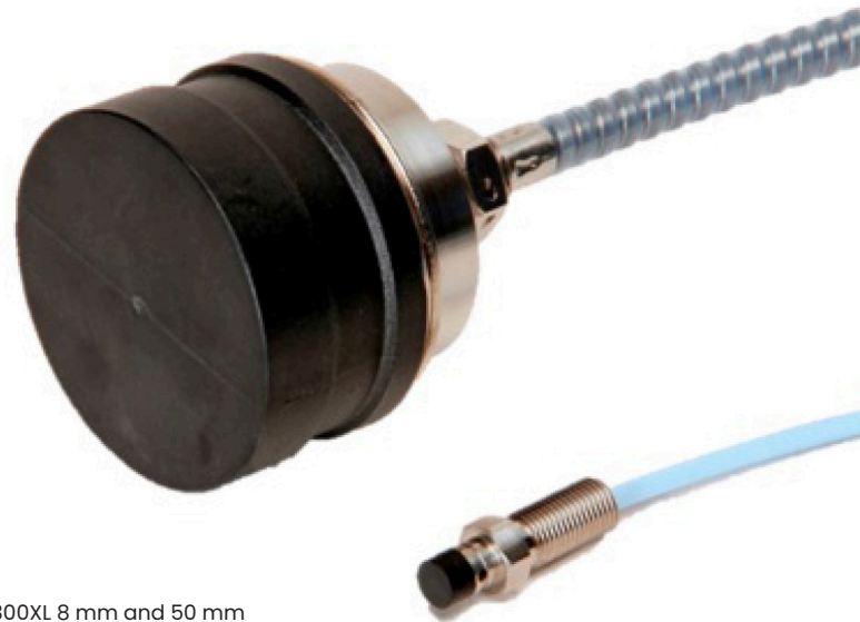
3300XL 8 mm and 50 mm Proximitors probes

In turn, you have come to trust in our solutions and our expertise, and the fact that we are committed to never compromise when it comes to safety, quality, and reliability.