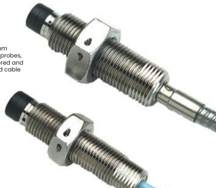
3300XL 11mm Proximitor probes, both armored and unarmored cable versions